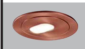
1420AC Antique Copper Trim