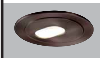
1420TBZ Tuscan Bronze Trim Ring