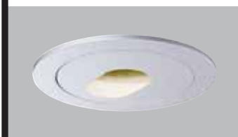
1420SL Silver Trim