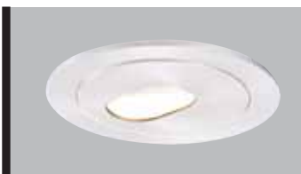
1420P White Trim