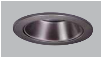
1421TBZ Tuscan Bronze Reflector with Tuscan Bronze Trim Ring