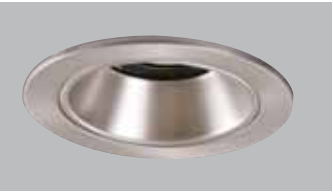
1421SN Satin Nickel Reflector with Satin Nickel Trim Ring