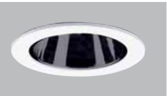
1421MB Black Specular Reflector with White Trim Ring