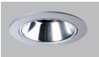
1421SL Clear Specular Reflector with Silver Trim Ring