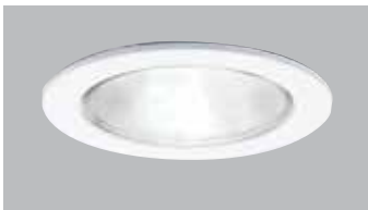
1421H Haze Reflector with White Trim Ring