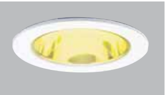
1421RG Residential Gold Reflector with White Trim Ring