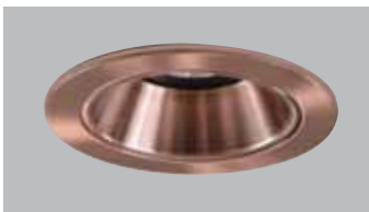
1421AC Antique Copper Reflector with Antique Copper Trim Ring