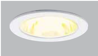
1421CG Champagne Gold Reflector with White Trim Ring