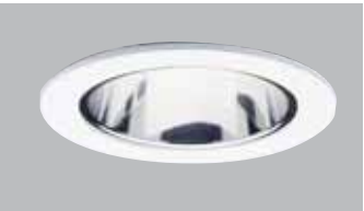
1421C Clear Specular Reflector with White Trim Ring