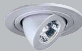
1496SL Silver Elbow with Silver Trim