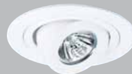
1496P White Elbow with White Trim