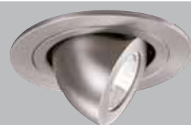
1496SN Satin Nickel Elbow with Satin Nickel Trim