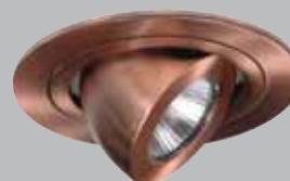
1496AC Antique Copper Elbow with Antique Copper Trim