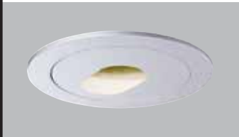
1420SL Silver Trim