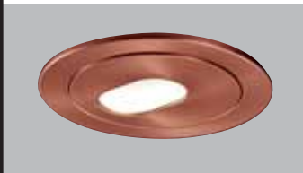
1420AC Antique Copper Trim