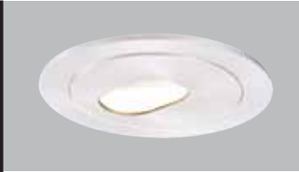
1420P White Trim