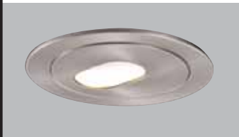
1420SN Satin Nickel Trim