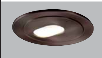
1420TBZ Tuscan Bronze Trim Ring