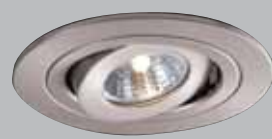
1495SN Satin Nickel Gimbal with Satin Nickel Trim