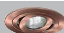
1495AC Antique Copper Gimbal with Antique Copper Trim