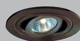
1495TBZ Tuscan Bronze Gimbal with Tuscan Bronze Trim Ring