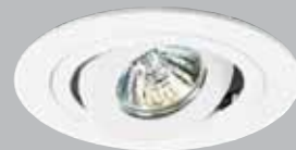
1495P White Gimbal with White Trim