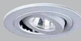
1495SL Silver Gimbal with Silver Trim