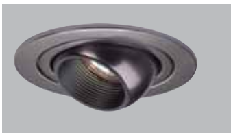
1498TBZ Tuscan Bronze Trim with Tuscan Bronze Eyeball, Black Baffle