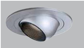
1498SL Silver Trim with Silver Eyeball, Black Baffle