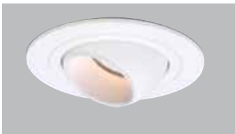
1498W White Trim with White Eyeball, White Baffle