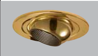
1498PB Polished Brass Trim with Polished Brass Eyeball, Black Baffle