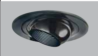
1498BC Black Chrome Trim with Black Chrome Eyeball, Black Baffle