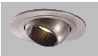
1498SN Satin Nickel Trim with Satin nickel Eyeball, Black Baffle