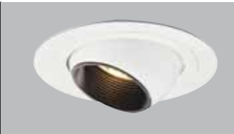
1498P White Trim with White Eyeball, Black Baffle