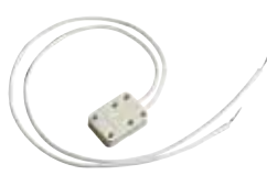
*22471 - GX5.3 Base Mini BiPin Quartz MR16 Socket 12" 18 Gauge Leads SF-1 200° C Leads 100 Watts Max., 250 Volts Height - 1"