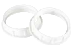
70001 2 Aluminum Shade Rings for Medium Base Sockets Outside Diameter - 2" Inside Diameter - 1 1/2" For use with porcelain threaded sockets.