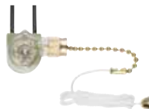
70290 Replacement Canopy Light Switch with Brass Finish Pull Chain 3" Braided Cord 6" Wire Leads Height - 1 1/4" Fits 3/8" Hole