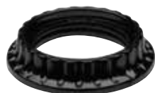
70435 Phenolic Shade Ring for Medium Base Sockets Outside Diameter - 2 3/8" Inside Diameter - 1 5/8" For use with phenolic sockets only.