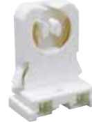
*22453 Medium BiPin Lamp Holder Low Profile Size 660 Watts Max., 600 Volts T8/T12 Non Shunted