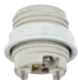
70010 Porcelain Threaded Socket with Aluminum Shade Ring Medium Base Height - 1 1/8" Ring Height - 1/2" 660 Watts Max. 250 Volts