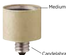
*22411 70361 Socket Adapter Enlarger Enlarges Candelabra Base to Medium Base 75 Watts Max., 125 Volts