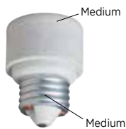
*22150 Porcelain Socket Extender Medium Base 660 Watts Max., 250 Volts Extension - 1/4" Overall Length - 2 1/4"