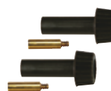
70161 2 Replacement Knobs Black Finish With 1/2" Extensions Tapped 3/16"-F x 1/16"-M