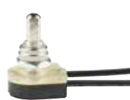
*22306 Push Canopy Switch 4 3/4" Wire Leads 18 Gauge, 105° Leads Fits 3/8" Hole 3A, 250 VAC 6A, 125 VL 6A, 125 VAC Height - 1 1/4"