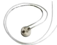
*22470 - GY6.35 Base Mini BiPin Quartz MR16 Socket 12" 18 Gauge Leads SF-1 200° C Leads 100 Watts Max., 250 Volts Height - 3/8"