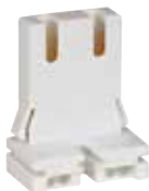
*22457 Medium BiPin Lamp Holder Floating Action for U-Shape Lamps Low Profile Size 20 Gauge 660 Watts Max., 600 Volts Non Shunted