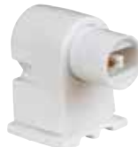
*22491 Plunger End Lamp Holder For HO, VHO, SHO Lamps 660 Watts Max., 1000 Volts Non Shunted