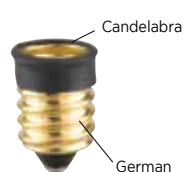
*22402 Socket Adapter Reducer Reduces German or Italian Base to Candelabra Size With Rubber Ring 75 Watts Max., 120 Volts