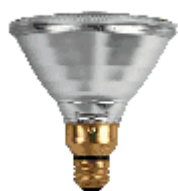
PAR38 STD Med Skt FL