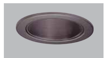
999MB Tuscan Bronze Reflector with Tuscan Bronze Trim Ring