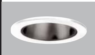
999MB Black Specular Reflector with White Trim Ring