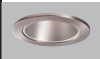
999MB Satin Nickel Reflector with Satin Nickel Trim Ring