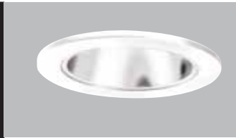
999 Clear Specular Reflector with White Trim Ring