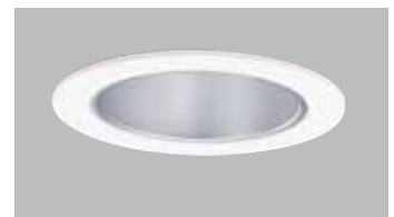
999H Haze reflector with White Trim Ring