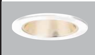
999RG Gold Specular Reflector with White Trim Ring