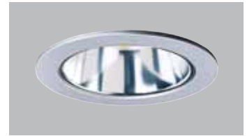
999SL Clear Specular Reflector with Silver Trim Ring