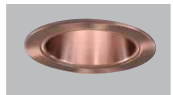
999AC Antique Copper Reflector with Antique Copper Trim Ring