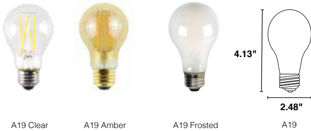
A19 Clear A19 Amber A19 Frosted

Product #: _____ Type: _____ Project: _____ Date: _____ Comments: _____ Initials: _____