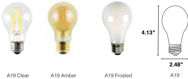
A19 Clear A19 Amber A19 Frosted A19

Product #: _____ Type: _____ Project: _____ Date: _____ Comments: _____ Initials: _____