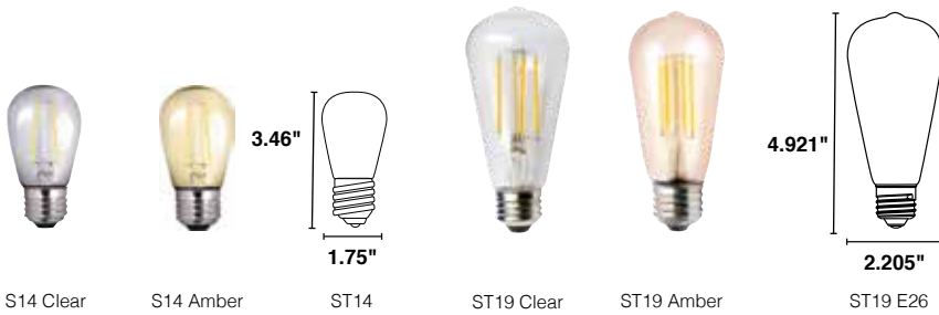
S14 Clear S14 Amber ST14 ST19 Clear ST19 Amber ST19 E26