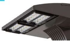
HS - House-side shields