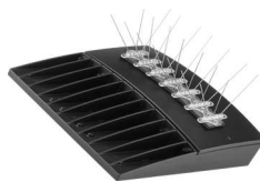
BSW - Bird-deterrent spikes