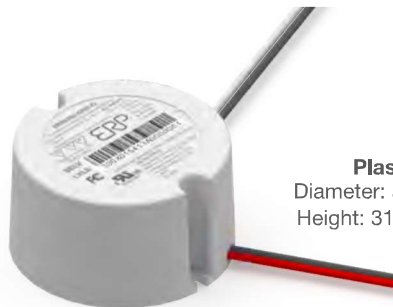
Plastic Case Diameter: 58 mm (2.28 in) Height: 31.7 mm (1.25 in)