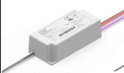
ESS Plastic Case L 84 x W 40 x H 25 mm (L 3.30 x W 1.57 x H 0.99 in)