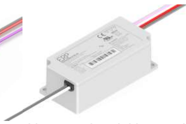
ESST Plastic Case (ESST40 only) L 84 x W 40 x H 27 mm (L 3.30 x W 1.57 x H 1.06 in)