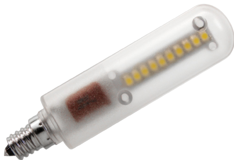
E12 Candelabra Screw Base