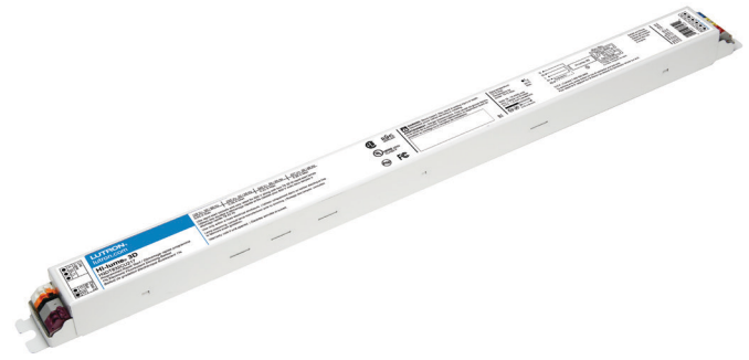
Hi-lume 3D, case type C 1.18 in (30 mm) W × 1.00 in (25 mm) H × 18.00 in (457 mm) L