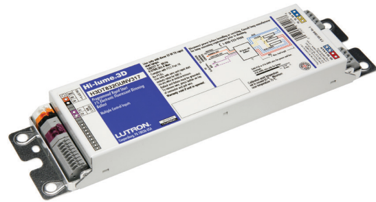
Hi-lume 3D, case type G 2.38 in (60 mm) W × 1.00 in (25 mm) H × 9.50 in (241 mm) L