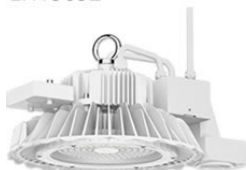
S1/S2 Factory Installed Sensor