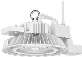
S1/S2 Factory Installed Sensor