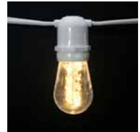
LED S14, smooth plastic, sun warm white