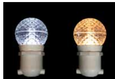
Cool White Sun Warm White