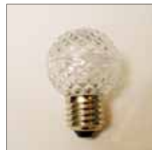
LED G50, E27 medium base