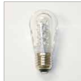
Thick, shatter-resistant plastic