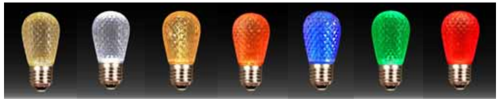
Sun Warm White Cool White Yellow Amber Blue Green Red

+Pieces per inner case/Pieces per master case