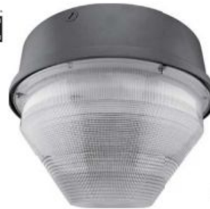
● Dark Bronze