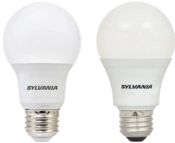
450lm and 800lm