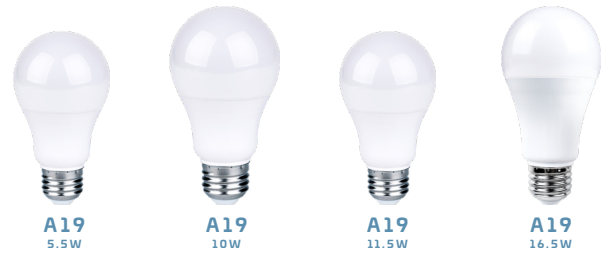
A19 5.5W A19 10W A19 11.5W A19 16.5W