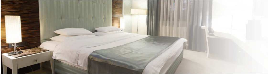
Application illustration only, subject lamps not used in photo.