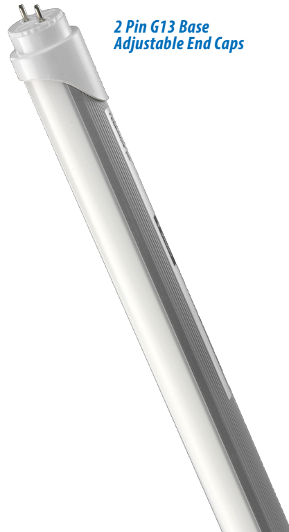
2 Pin G13 Base Adjustable End Caps