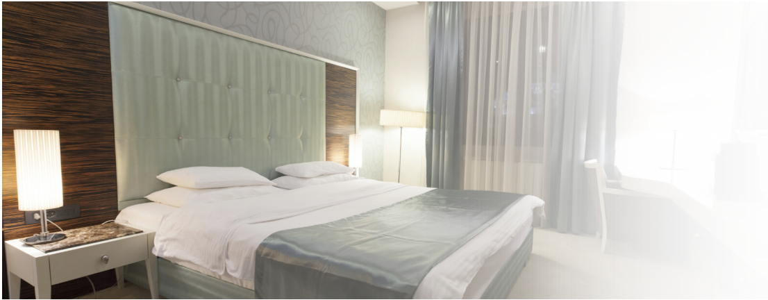
Application illustration only, subject lamps not used in photo.