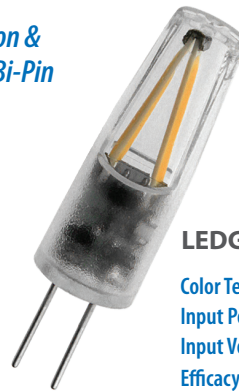
LEDG4BPF-1.5W-XNW-012V (Natural White)