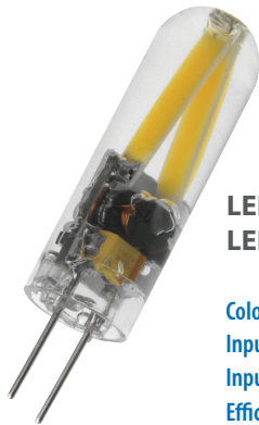
LEDG4BPF-1.5W-XIW-012V (Warm White) LEDG4BPF-1.5W-XPW-012V (Pure White)

Only 1.5 Watts, Replaces Xenon & Halogen T2/T3/T4 Tubular G4 Bi-Pin Bulbs of up to 15 Watts