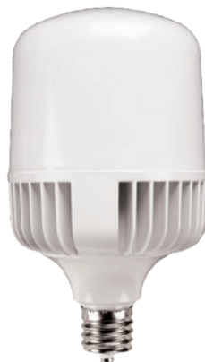
LHID250 E39 base