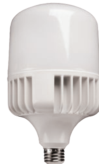
LHID150 E26 base