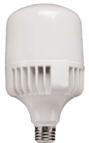
LHID100 E26 base