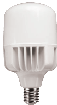
LHID175 E39 base