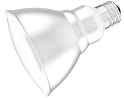
Weight: 7.7 oz.