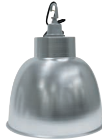
SKFHBSA (7) 6762711414 (4)