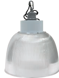
SKFHBP (7) 6762711225 (6)