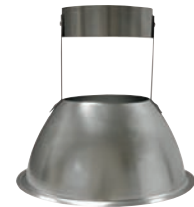
SKFHBA (7) 6762711230 (0)