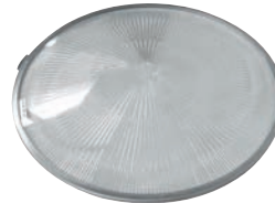
SKFHBCL (7) 6762711232 (4)