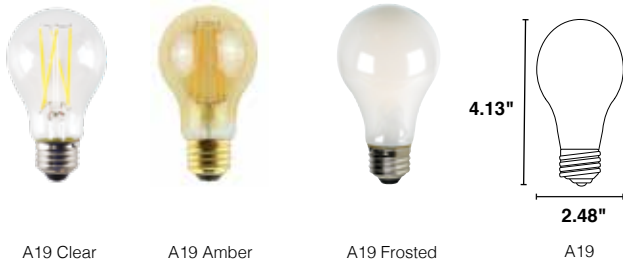
A19 Clear A19 Amber A19 Frosted

Product #: _____ Type: _____ Project: _____ Date: _____ Comments: _____ Initials: _____