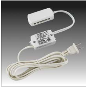
6 W Driver