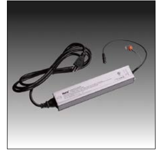
96 W Driver