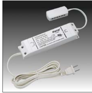
30 W Driver