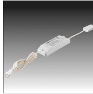
75 W Driver