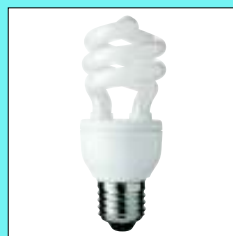
Tornado 11W E26/E27