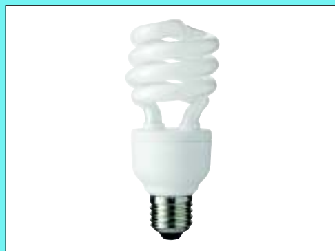
Tornado 20W E26/E27