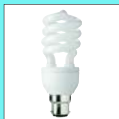
Tornado 15W B22