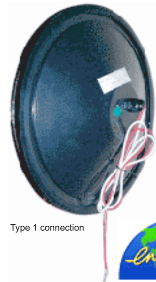
Type 1 connection

Only 6-10 Watts Energy Compared to 150W Incandescent