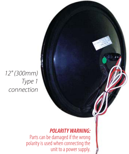
12" (300mm) Type 1 connection

POLARITY WARNING: Parts can be damaged if the wrong polarity is used when connecting the unit to a power supply.