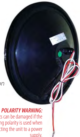
12" (300mm) Type 1 connection

POLARITY WARNING: Parts can be damaged if the wrong polarity is used when connecting the unit to a power supply.