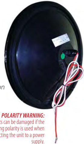
12" (300mm) Type 1 connection

POLARITY WARNING: Parts can be damaged if the wrong polarity is used when connecting the unit to a power supply.