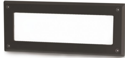
Shown in architectural bronze / opal

The Endurance Brick Light is constructed of die-cast aluminum with an Architectural Bronze, Black, White, or Graphite finish and Opal tempered glass for even illumination. Easily retrofits most existing incandescent brick light installations. Integrated 5.5 watt 120 volt factory-sealed LED light engine. 9.5 inch width x 4 inch height. ETL listed for wet locations. IP66 rated.